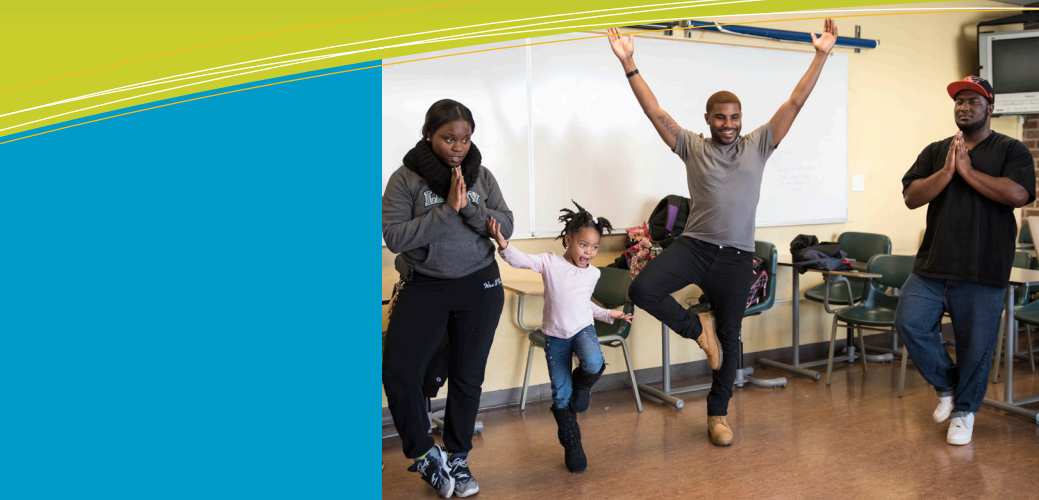
b2b students learn yoga as wellness activity during one of their weekly workshops.