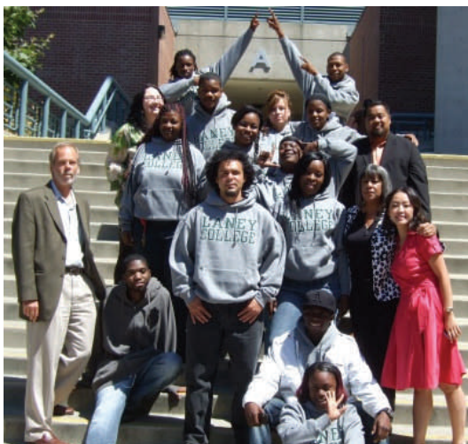
b2b students and faculty celebrate the completion of August's two-week bridge course.

Do you remember starting college? For most of us it was an exciting, confusing, fun, and often very overwhelming time. Many of us got through that first year knowing that we could rely on our families back home to provide us with advice, a little money, an occasional care package. Now imagine how much harder it would have been without that support. That's what college is like for most former foster youth, who face